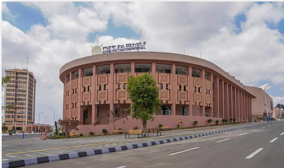
Adwa Victory Memorial Museum